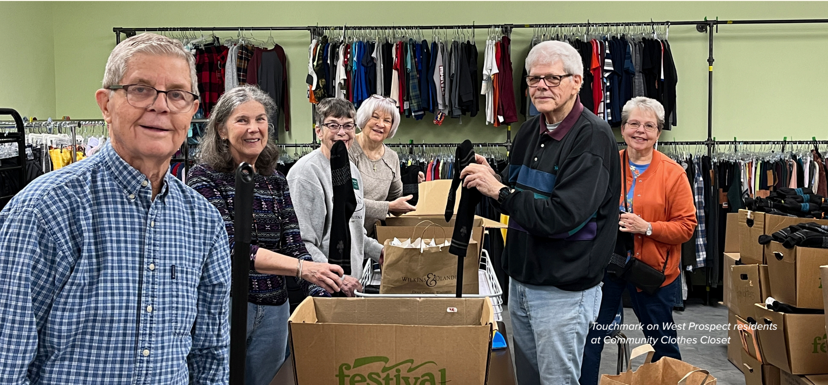
Touchmark on West Prospect residents at Community Clothes Closet

Touchmark on West Century Newsletter | Issue 2 • 2024